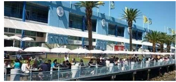
Sydney Fish Market (Sydney)

Explore the Royal Botanic Garden, a lush oasis in the heart of Sydney, showcasing urban greenery and sustainable landscaping for healthier city living.