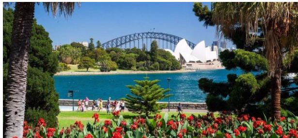
Royal Botanic Garden (Sydney)

Explore the Royal Botanic Garden, a lush oasis in the heart of Sydney, showcasing urban greenery and sustainable landscaping for healthier city living.