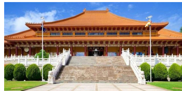
Nan Tien Temple (Wollongong)

Explore the Melbourne Sports and Aquatic Centre, highlighting the importance of fitness and recreation in a smart city, promoting a healthier lifestyle.